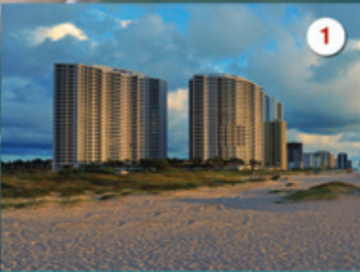
RITZ CARLTON RESIDENCES SINGER ISLAND 242 Residences in 2 Towers From $800,000 to $4,995,000

DERMOT OBRIEN | 561.317.1177 | info@islandsrealty.com | www.Islandsrealty.com