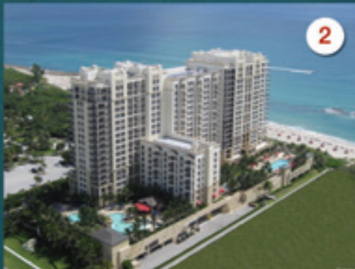
PALM BEACH MARRIOTT SINGER ISLAND 66 Tower Residences, 249 Hotel Condominiums & On-site Marriott Resort Hotel from $125,000 to $3,800,000