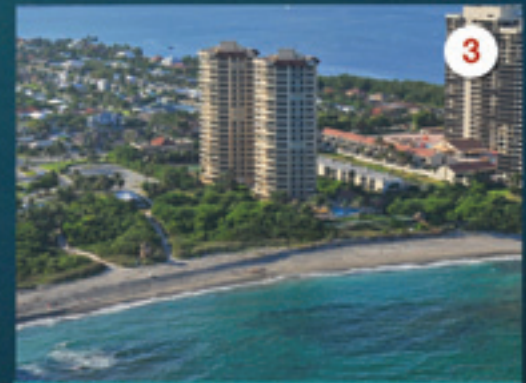
OASIS SINGER ISLAND 38 Residences in 2 Towers, Only 1 Residence Per Floor from $1,425,000 to $2,995,000