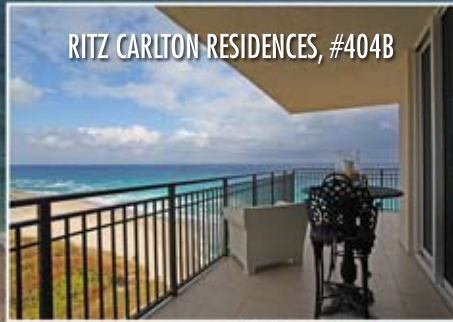
RITZ CARLTON RESIDENCES, #404B