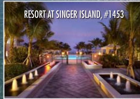
RESORT AT SINGER ISLAND, #1453

*Islands Realty is on-site at 3800 N. Ocean Drive only for real estate incident to this property